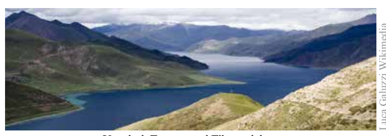
Yamdrok Tso - sacred Tibetan lake

signs to have reincarnated himself in a new-born infant. The baby, but a few days old, is brought into the presence of the people and reverentially placed upon the altar. Suddenly rising into a sitting posture, the child begins to utter in a loud, manly voice, the following sentences: 'I am Buddha, I am his spirit; and I, Buddha, your Dalai-Lama, have left my old, decrepit body, at the temple of ... and selected the body of this young babe as my next earthly dwelling.' Our scientist, being finally permitted by the priests to take, with due reverence, the baby in his arms, and carry it away to such a distance from them as to satisfy him that no ventriloquial deception is being practised, the infant looks at the grave academician with eyes that 'make his flesh creep,' as he expresses it, and repeats the words he had previously uttered